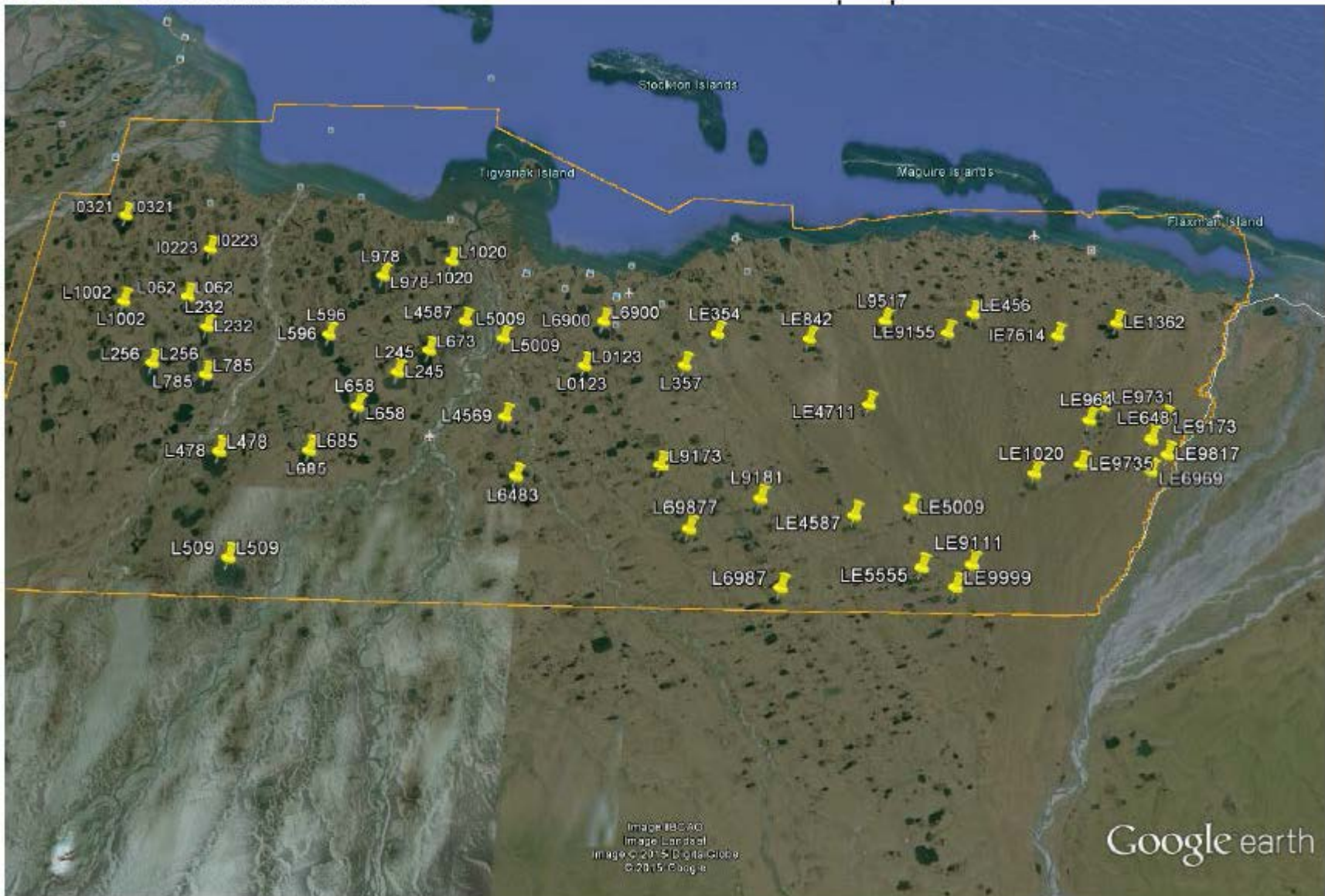
Image: BCCAO Image: Landsat Image © 2015 DigitalGlobe © 2015 Google